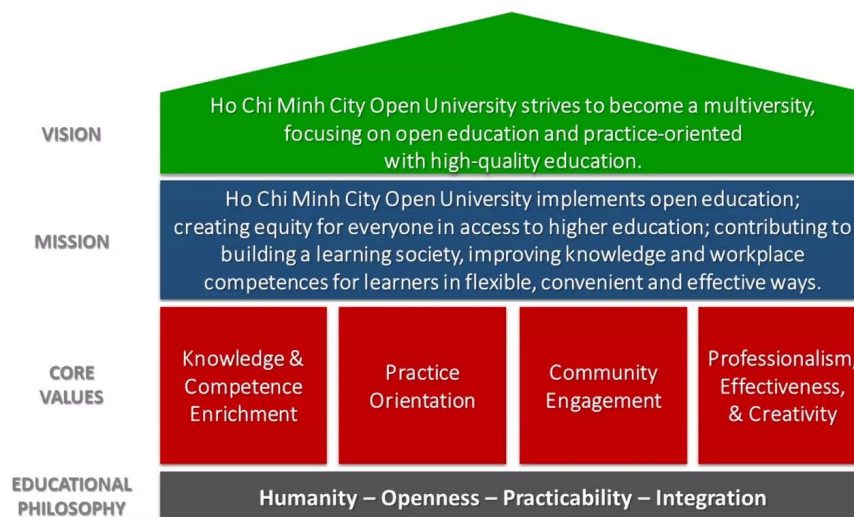
Figure 1 Mission, vision, core values and educational philosophy at HCMCOU

During the online reception, the University’s representatives stated that their goal is to develop HCMCOU into a “multiversity” that is a multi-disciplinary public university. Therefore, until 2030, HCMCOU intends to integrate issues like global integration, digitalization, connection to employers and diversity to its operations.