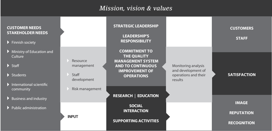
FIGURE 3: The connection between strategic leadership and quality work

The essential features of this process are illustrated in the Figure 3 which is supplemented by the descriptions of functions, tasks and responsibilities, as well as core processes in the Main Quality Manual and the information given in the Strategic Implementation Programme.