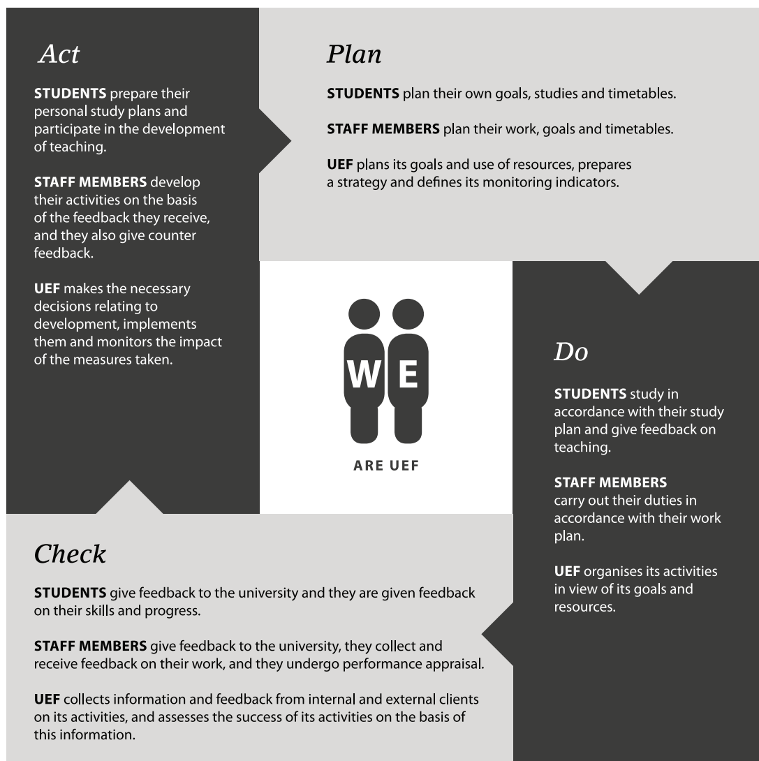
FIGURE 2: UEF's Plan-Do-Check-Act model

As can be seen from the figure, the quality cycle embraces the entire institution and so does the institutional quality policy, which stems from the conviction that quality work is part of each and everyone's daily responsibilities and quality per se is a commonly shared value. The quality policy and quality work are approved by the University Board and implemented and executed through various actors, with the Leadership Group acting as steering committee and the quality manager as the operational driver.