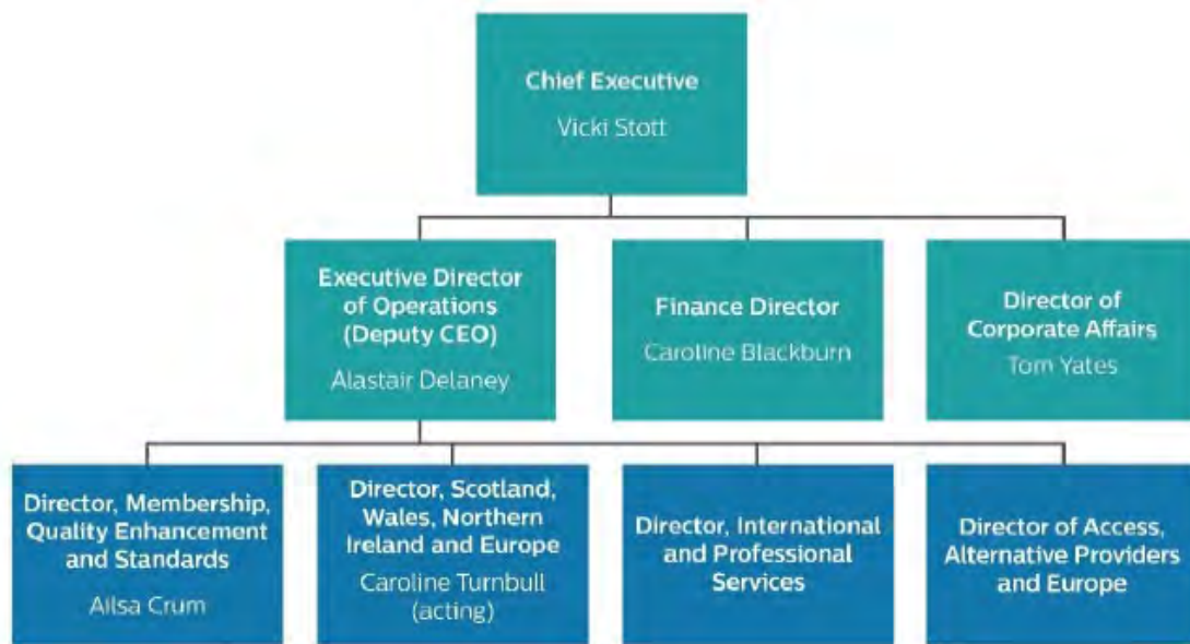
Figure 1: QAA's organisational structure