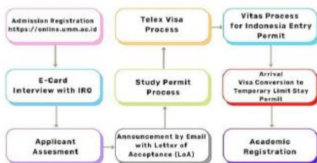
Figure 2 International Admission Procedure